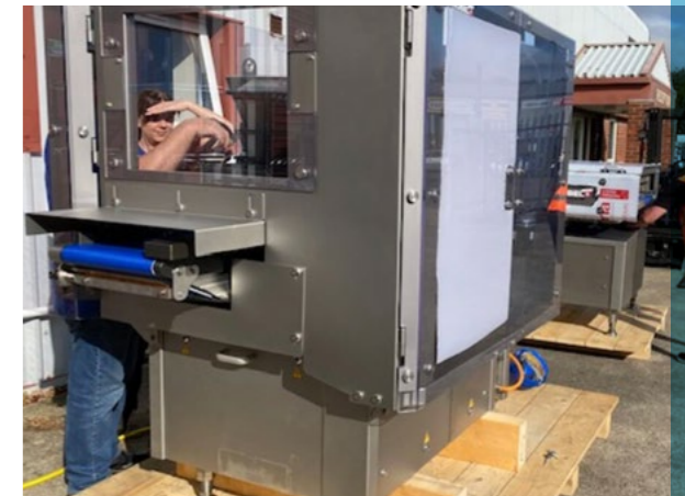
With the purchase of the TCM Alpha compact, Hames Chocolates takes a big leap forward. Bright eyes on arrival of the brand new machines.