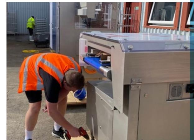
This new addition will expand the production capacity of Hames Chocolates. Carol's employees are thrilled.