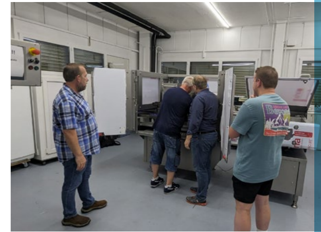
Employees of Hames Chocolates inspect their new machine in the R & D laboratory of Trikno in Felben. It won't be long before the new depositor is integrated into the production line. The anticipation is rising.

When asked why they chose Trikno, Carol explained, "Expanding production capacity to adapt to changing consumer trends is a critical step for the growth and success of our business. To achieve this goal, we need to invest in new equipment that is reliable, delivers results and integrates seamlessly with our existing production lines. We turned to Premier Forrester because a Trikno machine seemed like the best solution - after all, we already use Knobel machines and know the outstanding performance they offer. The business growth we seek depends on precise, creative and flexible applications - something we know a Knobel by Trikno machine can deliver best.