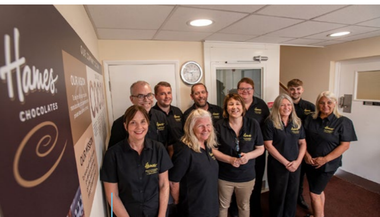
The team at Carol Oldbury is looking forward to the new TCM Alpha compact casting machine and vibration table