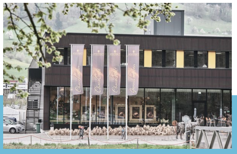
Customer: Aeschbach Chocolatier AG | www.aeschbach-chocolatier.ch